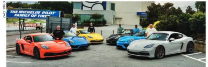
Remember, smooth is fast, and shiny side up!

If you are interested in going, or have questions, please contact our soon to be instated HPDE Chair... or for now just ask The Web Lackey .