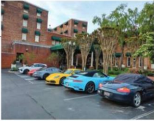
▲ "Once again, nearly 100 PCA members took over the General Morgan Inn in Greeneville, Tennessee, for Smoky Mountain Region's annual Spring Thing. The Saturday morning concours featured many beautiful Porsches, followed by an afternoon gimmick rally through the Smoky Mountains. We finished off the weekend with an autocross on Sunday."

The Smoky Mountain Region got a lot of national attention this year in the PCA magazine, Panorama .