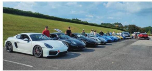
▲ "After attending Parade 2024, a dozen Smoky Mountain members shifted to DE mode and attended the Alabama Region Father's Day drivers education event at Barber Motorsports Park near Birmingham. We had two days of fun, intense driving, with five drivers advancing to the next group. Good times, fun cars, great people!"