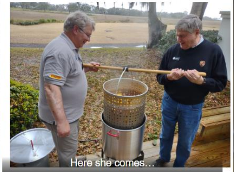
Here she comes...