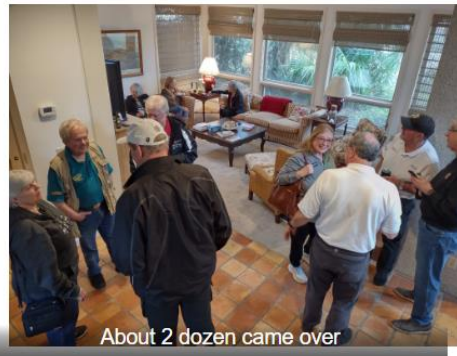
About 2 dozen came over