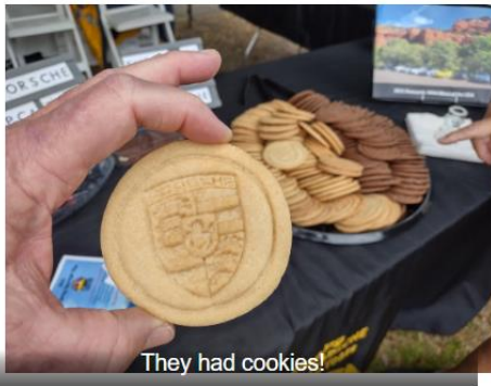
They had cookies!