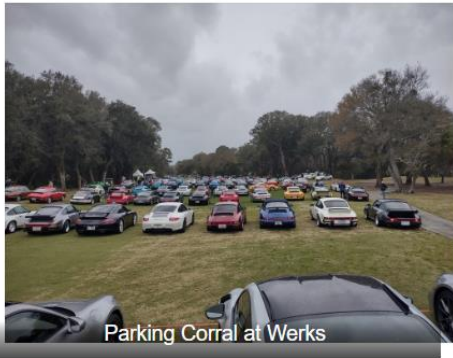
Parking Corral at Werks