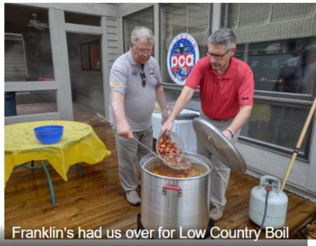
Franklin's had us over for Low Country Boil