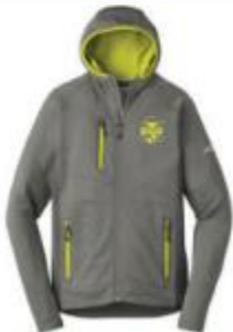
Eddie Bauer Men's Sport Hooded Full-Zip Fleece Jacket