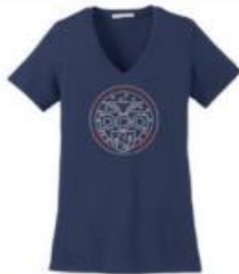
PCA logo Rhinestone Ladies Scoop T-shirt