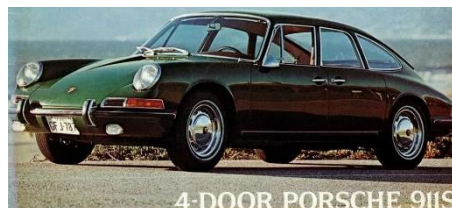
4-DOOR PORSCHE 911S

(Program Note: Porsche DID NOT do this one... Get all the deets on this one-off Thanks, Paul!!)