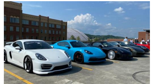
Figure 3 - Concours lineup