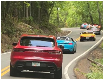
Figure 4 - Drive on The Snake