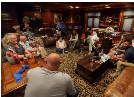
Figure 7 - More After Party