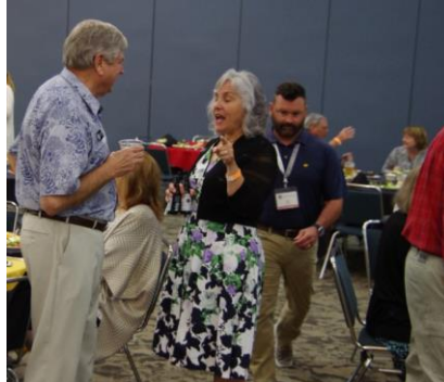
Figure 5 - Banquet Social