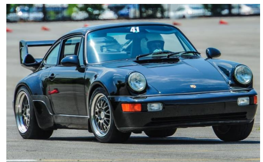
Figure 9 - And THEY'RE OFF!

See all the Spring Thing pix online at the website .