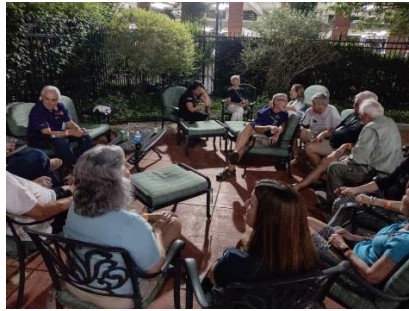
Figure 2 - After Party!!