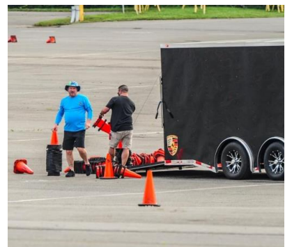
Figure 8 - Setting cones, Boss!