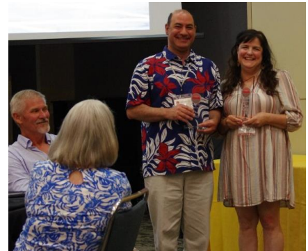
Figure 6 - AWARDS!!!