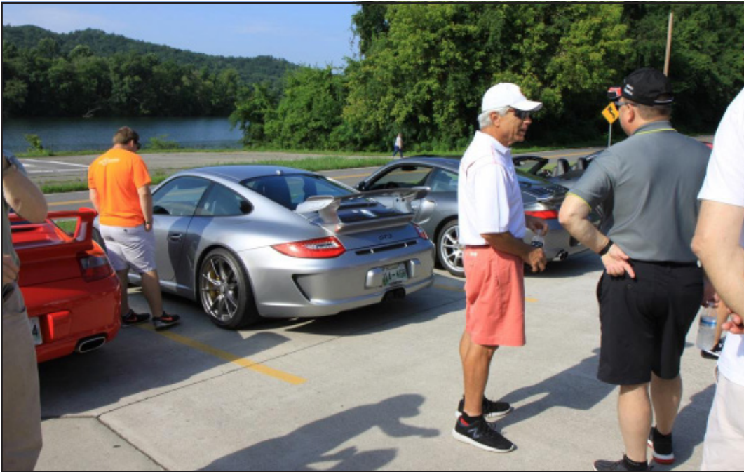
All Spring Thing photos by Ross Spence