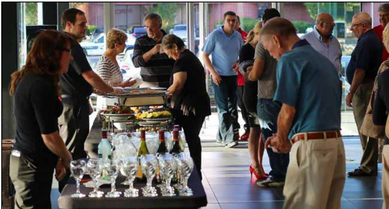
Attendees roamed the new Harper showroom enjoying refreshments, visiting with fellow PCA members, and viewing the new Porsches on display.