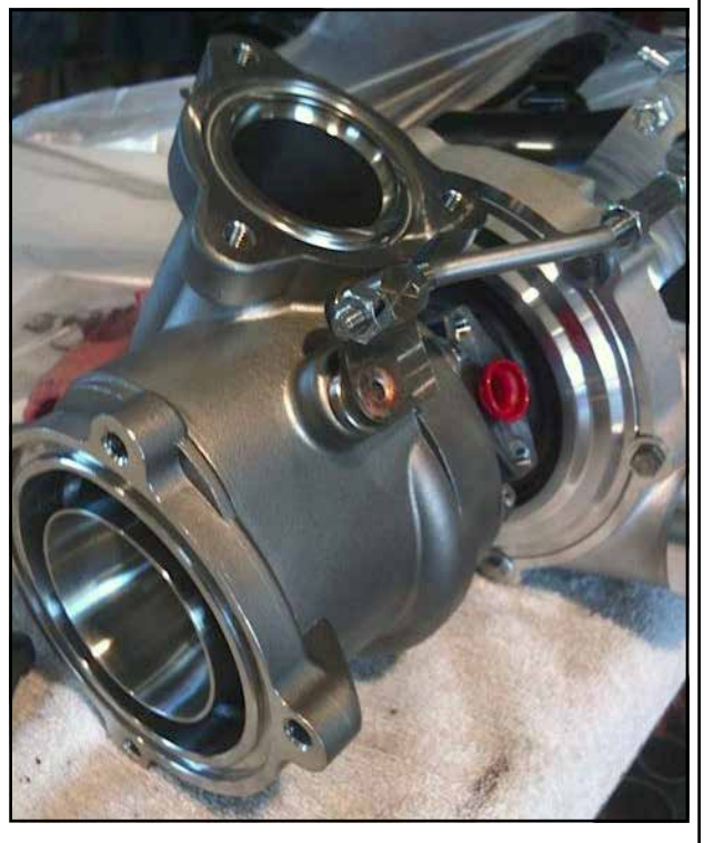
A peek under the hood and closeup of the EVO kit.