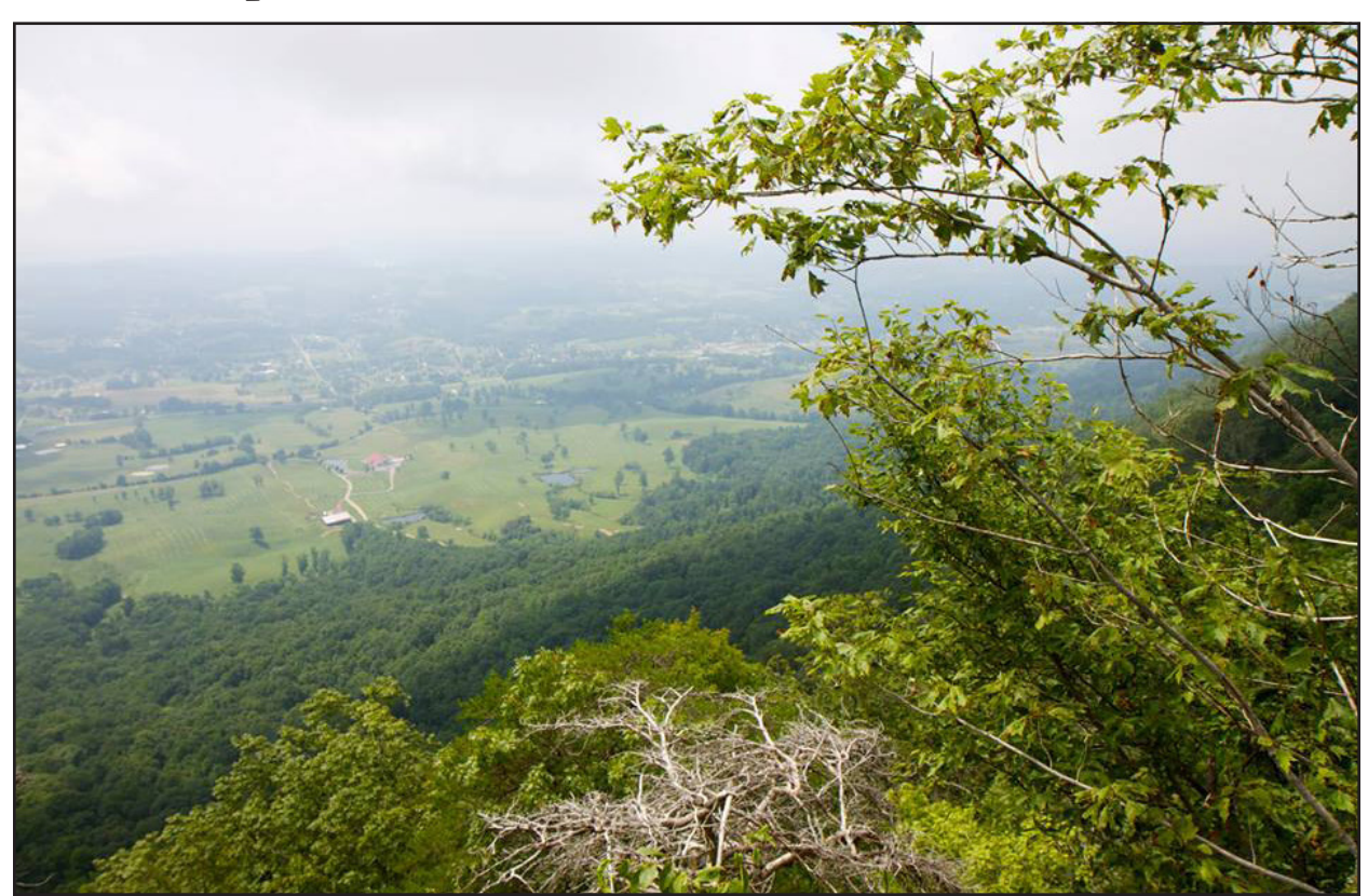
View from McCloud Mountain.