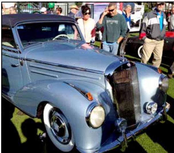
Classic Mercedes... love it!

Over 20,000 onlookers crowded onto the 11th and 18th greens at the Ritz Carlton this year to view 250 cars, invited to show at this years' event. The main event was the Sunday Concours with Jochen Mass as the Grand Marshall. Everything from a Fiat Topolino with basket weave seats, to the largest display ever of the automobile America... known for its 'underslung look', to Ferrari, Maserati, Mercedes, BMW, and many, many other makes including, of course, Porsche!