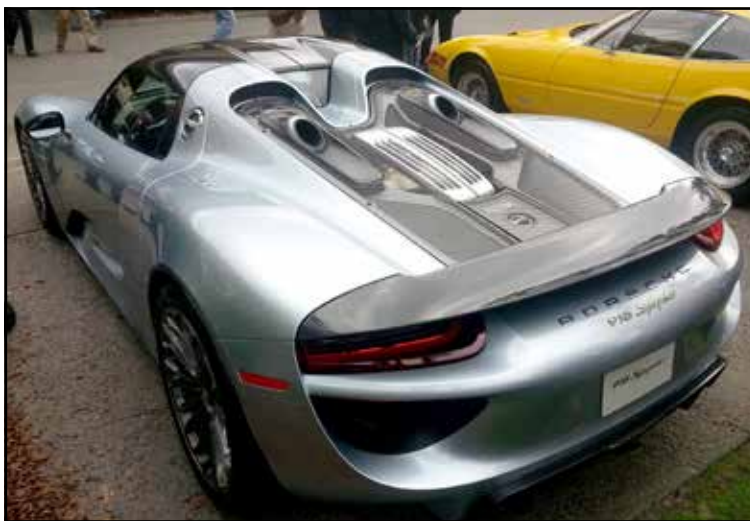
Wow! just... wow!

19th Anniversary Amelia Island, FL March 7-9, 2014