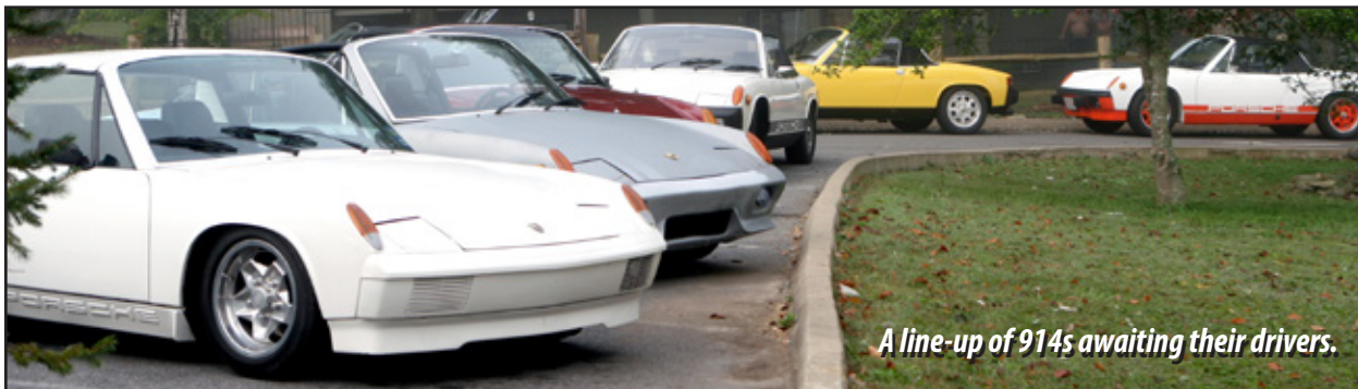
A line-up of 914s awaiting their drivers.