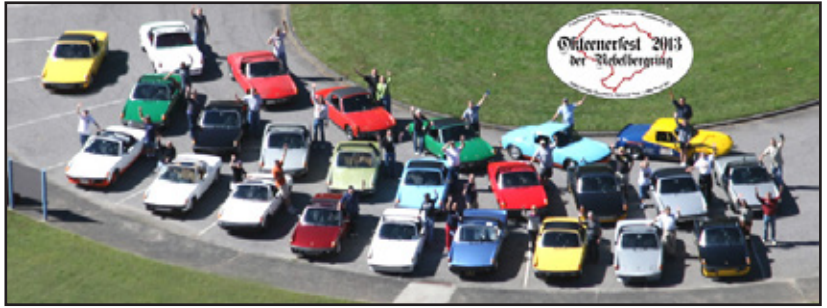
Twenty-five 914s and their owners lined up below Fontana Dam.

Once the drivers reached US129, a scheduled regrouping stop was made before entering the Dragon. With the morning fog finally clearing and the sun warming up the day, targa tops were stowed in the rear trunks and the 914s headed south to "slay the Dragon."