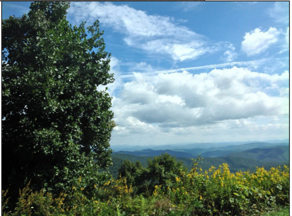
View from Mt. Pisgah Inn in Waynesville, NC.