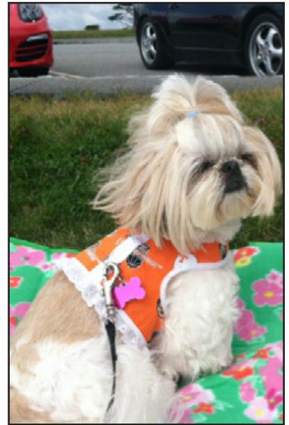
This "Porsche Puppy" loves going to the Region's events (and is obviously a Vols fan!)