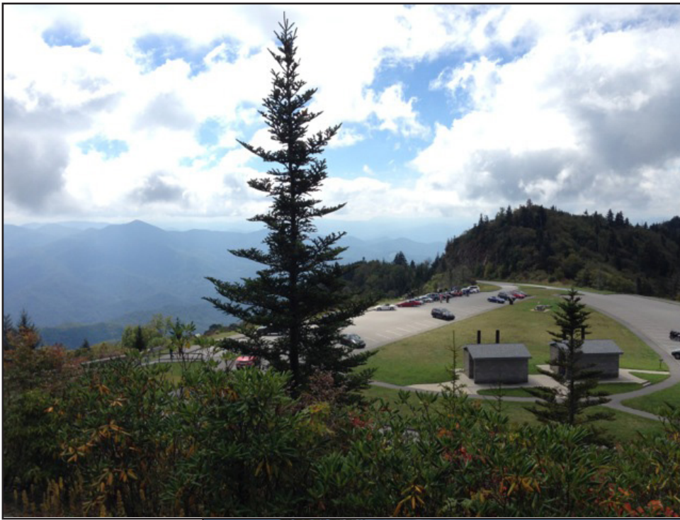
Water Rock Knob.