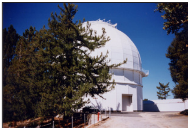
Mount Wilson Telescope.

As you can see, you have plenty to look forward to in Escape 2013. Did I forget to mention Rodeo Drive, Hollywood, Beverly Hills, air museums (pick one of many), Griffith Park, the Reagan Library, the California missions? The list goes on and on. Registration opens soon, so mark your calendars and keep your eye on our website and PCA's eBrake News for more information: http://escape2013.pca.org