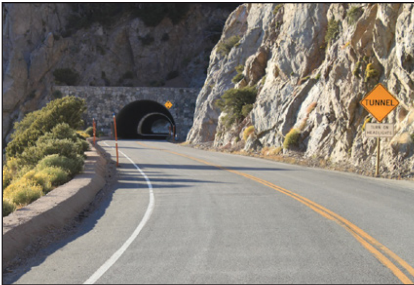
Approach to Angeles Crest Tunnel.

The Escape has two official dinners planned, starting on Thursday night with the opening Car Show and Drive-in Movie banquet. Remember your high school years of polishing up the car to show off to your friends, cruising to the hamburger stand and seeing the latest movie at the drive-in? While watching a classic movie (or socializing if you prefer), Escape attendees will munch on Kobe sliders, tacos, fries, margaritas, sodas, and milk shakes. The car show