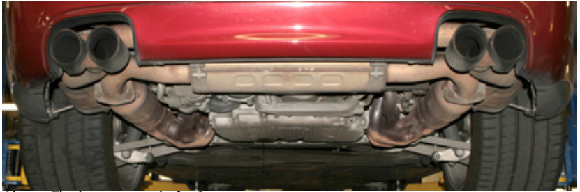
Above: The business end of a C4

Clockwise from right: Janet Lanz-Pasha watches as the Harper Tech inspects the suspension on her new Boxster; super clean suspension of Janet's Boxster; late model Porsches feature flat panels covering the under carriage to promote better aerodynamics.