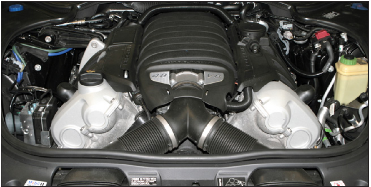
Above: V8 powerplant of Newsom Baker's Panamera