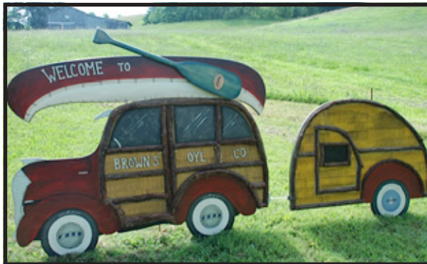
Above: Welcome Sign leading to Brown's Garage