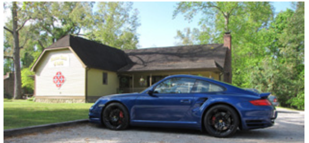
For those with an appetite you might want to stop here.