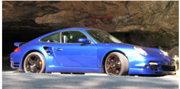
One more Turbo love. OK, I fess up, I didn't see the red graffiti hearts until after I took the photo.