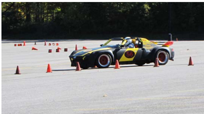
Jeff Gordon on Course