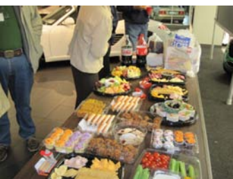
Very Nice Spread at the New Member Social

The PCA Rennsport IV team and its many volunteers made the Club a proud participant in a spectacular and memorable event.