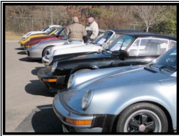
Great Porsche Showoff Photos