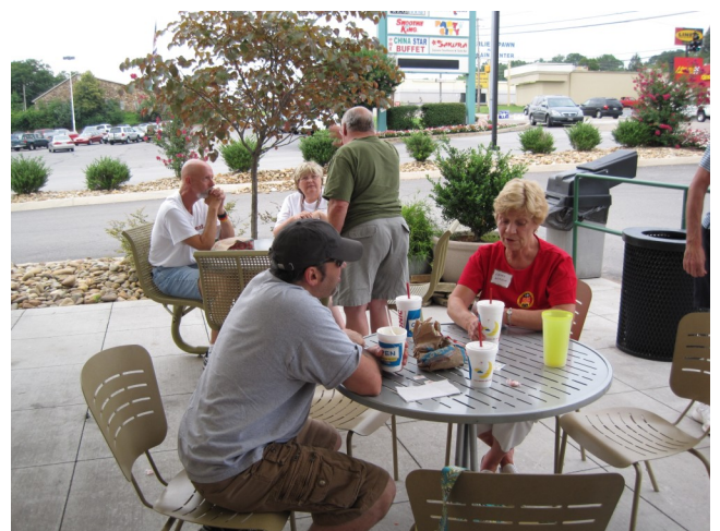
Members enjoying the social at the Sonic.