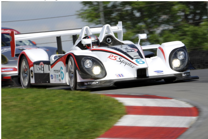
Porsche at Mid Ohio