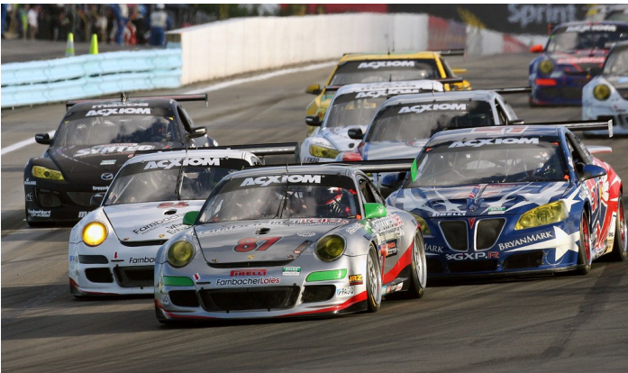
Flying Lizard at Miller Motorsports Park