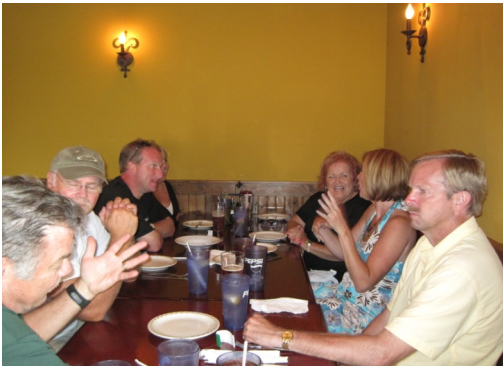
Feeding ourselves after the Show Off at Brick Oven Pizza in Lenoir City