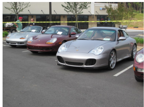
Cars at the Food City Show Off