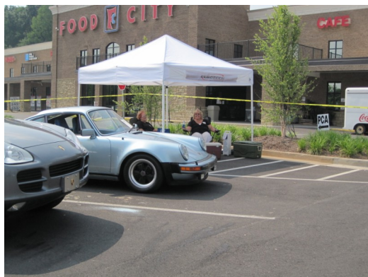
Staying Cool at the Show Off

Smoke Signals is published monthly by the Smoky Mountain Region of the Porsche Club of America (PCA). Opinions expressed in Smoke Signals are those of the contributor(s), and do not necessarily reflect the opinions of the Smoky Mountain Region officials, directors, or members, or those of the PCA. We reserve the right to edit all material as may be necessary. Comments, suggestions, articles, and photos are welcome.