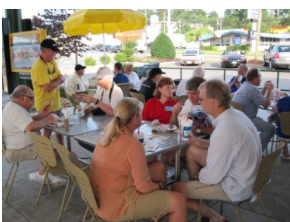
Drive Out To Sonic