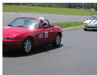
Cars in staging at autocross

All that being said, at the right price I recommend this model, it is a tremendous car and a great achievement by Porsche.