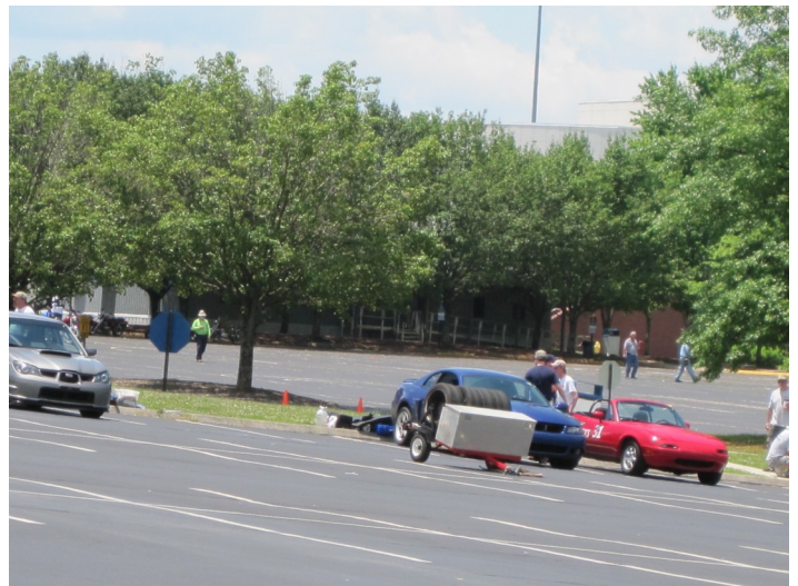
Autocross Attendees prepping their cars For the May 31 event.