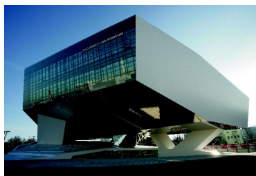
New Porsche Museum