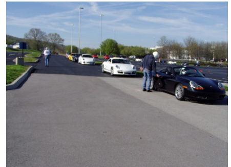
April 5 Event