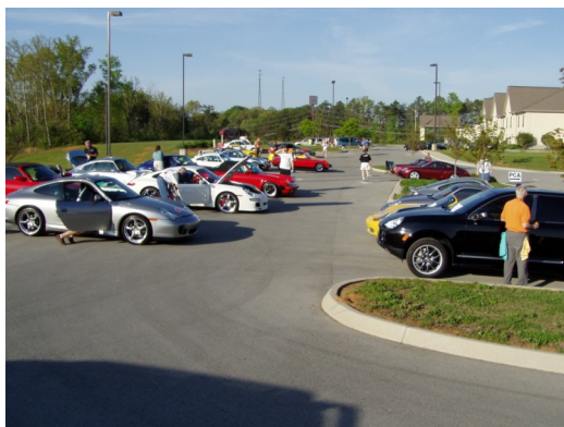
Spring Thing 2009 Concours

May 31: Autocross, Pellissippi State. See article for more information.