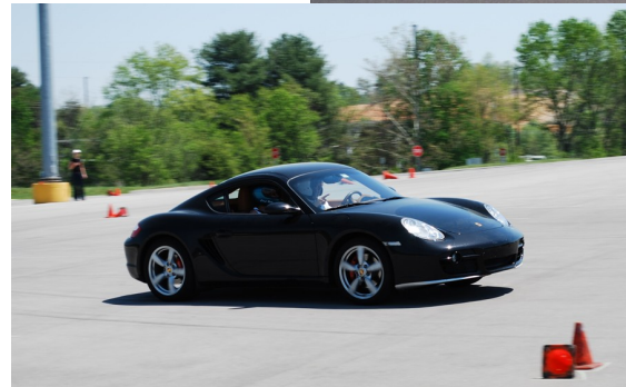
Dan Vess on Track at Spring Thing Autocross