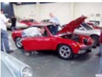
Judges look over Greg's car, the overall winner