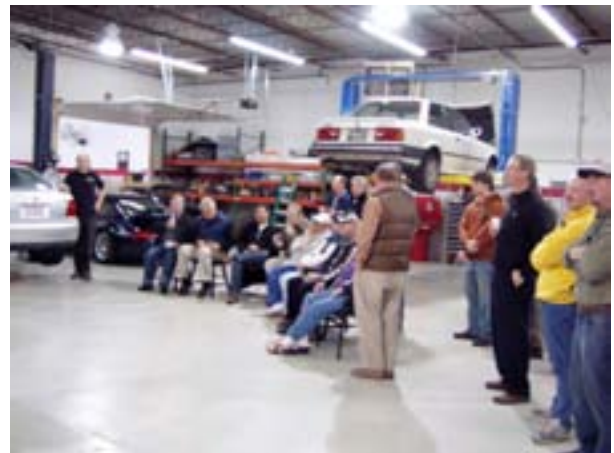
Club members learning about tires and car balance

Excellent session, thanks to the folks at European Auto Garage for their hospitality. More pictures on the web site.