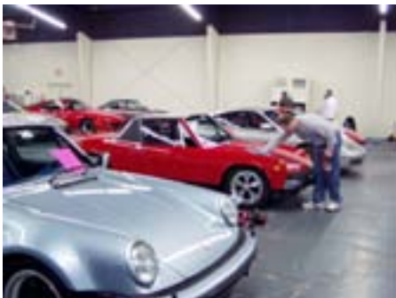
Greg found a speck of dust he missed