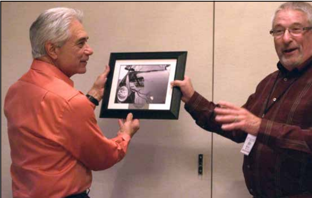
All Spring Thing photos by Damon Lowney