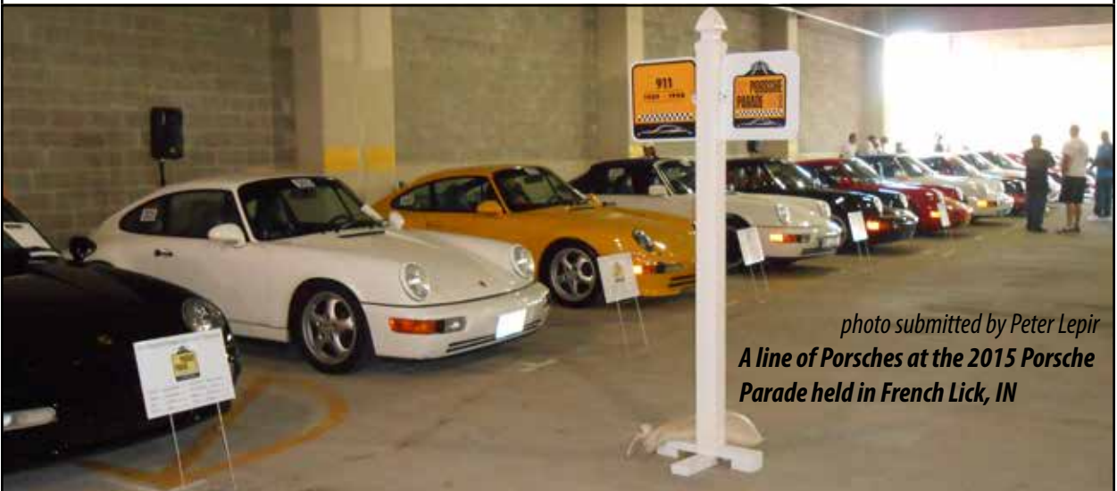
A line of Porsches at the 2015 Porsche Parade held in French Lick, IN