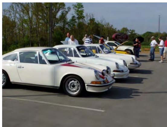
Spring Thing 2008 Concours

The time for Spring Thing is quickly approaching. Take a look at the flyer/registration in this newsletter. Make your hotel reservations soon, send in your registration now to assure yourself a spot in the event.